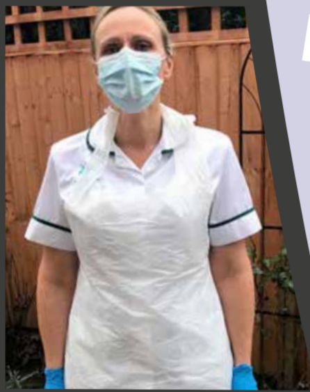
Staff feel uncomfortable in the Personal Protective Equipment (PPE) required for home visits, but adhere to strict Covid-secure guidelines.

"You have made me feel safe and supported, from letters to all the phone calls and the speed in which everything has happened. My new commode came the next day. Thank you again for everything."