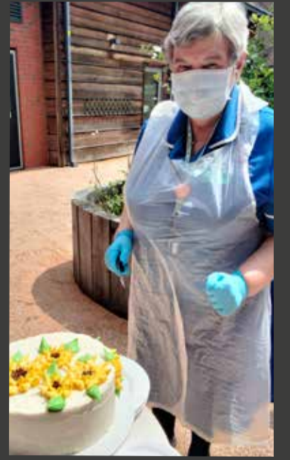
Staff say a virtual goodbye to a retiring colleague, with no hugs. New staff are embraced virtually onto a caring team.