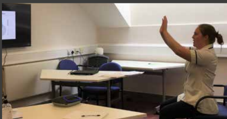
The team hold virtual tai chi sessions for patients to aid mobility, and enhance physical and mental wellbeing.