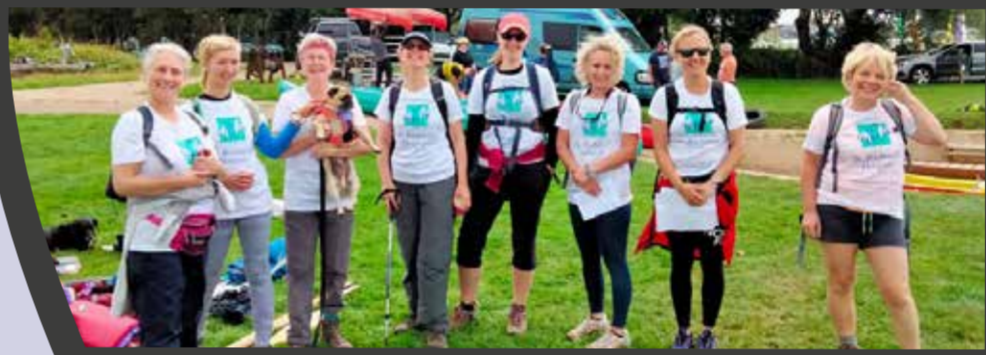
Eight team members complete a 35-mile Paddle Plod and Pedal challenge, raising more than £2,000 for St Richard's Hospice.