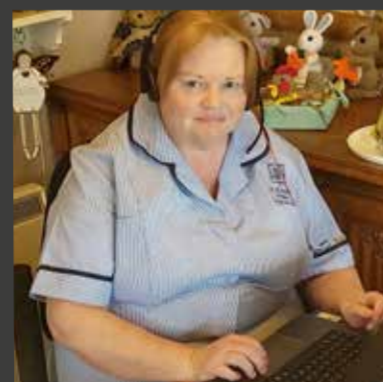
Staff make the most of working from home.

Social drop-in groups start on Zoom, such as Cuppa and Chat, Nature Therapy, and art clubs.