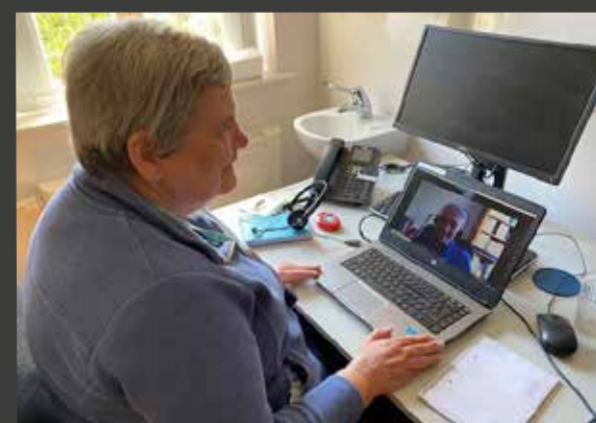
Confidence with technology grows. This leads to staff supporting patients to get online too. Relaxation drop-in sessions, complementary therapy treatments, breathlessness and fatigue advice delivered online.

"Thank you for the PowerPoint and the interesting and engaging sessions. You give such inspiration."