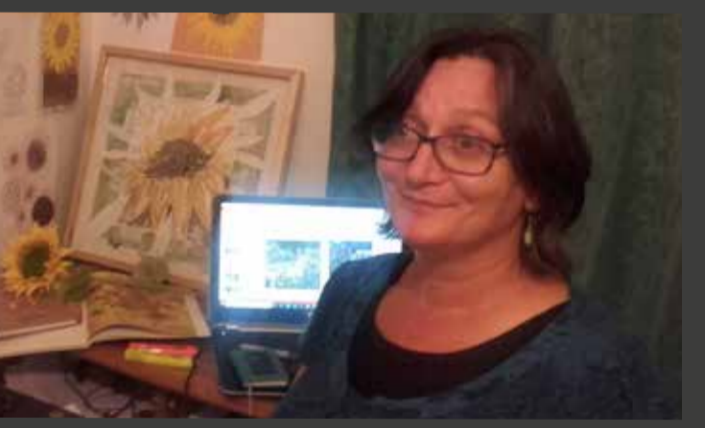
Courses in card making, journaling and drawing developed throughout the year. Patients created sunflower artwork for an outdoor community gallery.